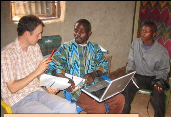
Working on the Kadung language