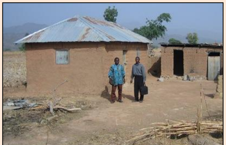
The Kadung language development office

language helper. A few students have helped to produce posters showing the local names of different body-parts (something which is very popular here). All of our students need your prayers. They return to school in a week's time to write up their research, but we don't want the projects to lose momentum in their absence. We want all of these tiny mustard seeds to grow into mature and healthy language projects.